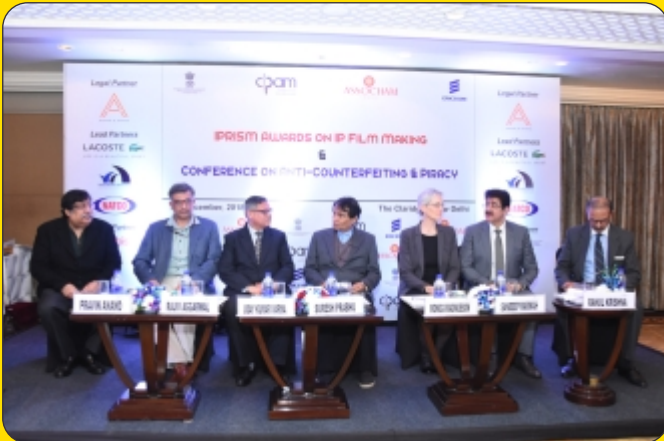
Shri. Suresh Prabhakar Prabhu, Hon'ble minister Ministry of Commerce and Indust Government of India